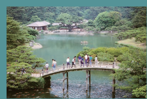
Takamatsu Ritsurin Garden