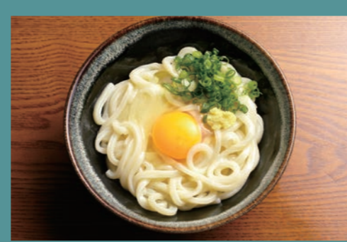
All over KAGAWA Sanuki Udon