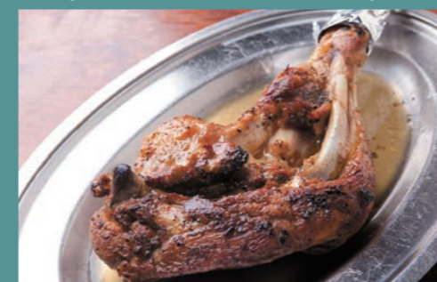
Takamatsu, Marugame Honetsuki-dori (chicken dish with bones)