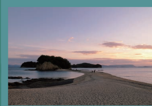
Shodoshima Angel Road