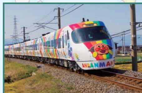
Yosan Line Anpanman Train