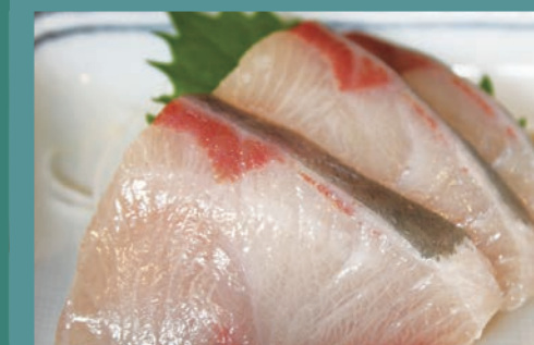
All over KAGAWA Olive hamachi