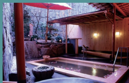
Kotohira Kompira Onsen