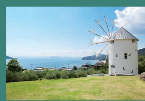
Shodoshima Olive Park