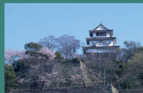
Marugame Marugame Castle