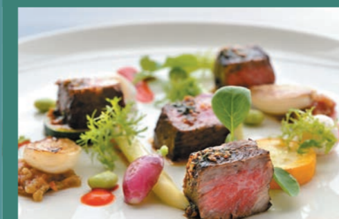
All over KAGAWA Olive beef