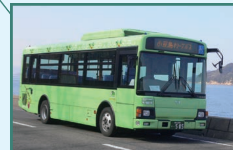
Shodoshima Olive Bus