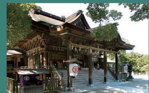
Kotohira Kotohira-gu shrine