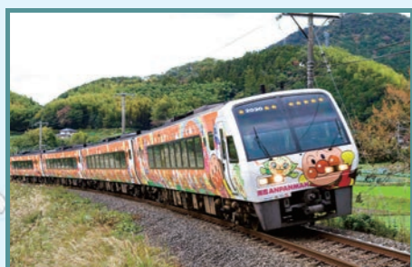
Dosan Line Anpanman Train