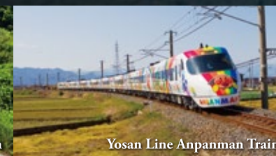
Yosan Line Anpanman Train