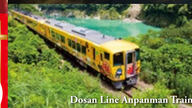
Dosan Line Anpanman Train