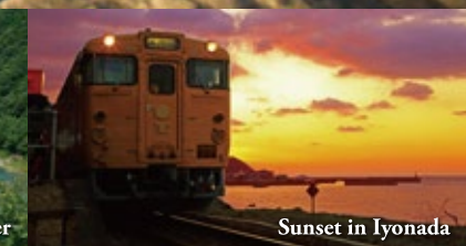
Sunset in Iyonada